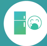
Distractions within the employee's home