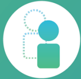
Lack of face-to-face interaction

Remote employees face unique challenges. While numerous studies show that remote employees can achieve levels of productivity that are the same as or higher than their non-remote peers, this isn't without obstacles. According to the Harvard Business Review, challenges remote employees often encounter include: