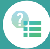
Limited or lack of access to necessary information