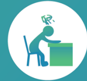
Lack of motivation

Managers should acknowledge these challenges, but can also take steps to address obstacles their team members may encounter. This section offers considerations for addressing challenges your employees may face in the remote environment.